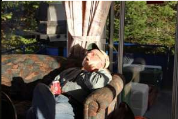
Pre-sleeping, the best way to prepare to go to bed!