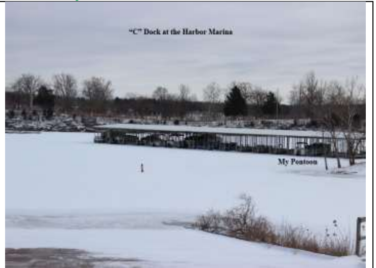
"C" Dock at the Harbor Marina