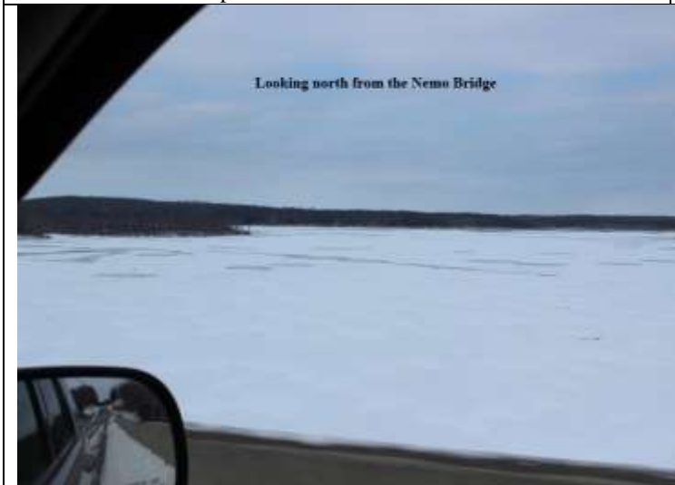
Looking north from the Nemo Bridge