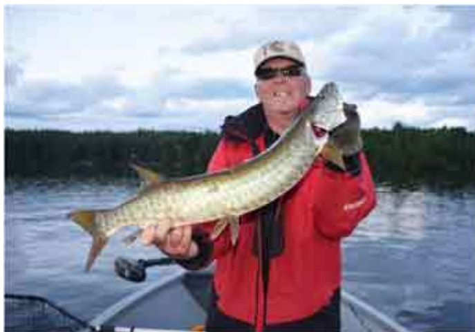
#200 - 33"

Fish #199 was caught about 8:30pm. I had just about given up on catching anything but this one was real aggressive on the figure 8. The 41" Muskie hit a Kramer Bros bucktail. We decided to head in but wanted to troll a little with a Naze Livid Fish and this little 33" decide to hit. The little guy was number 200 registered to Muskies Inc.